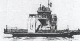
Sugar Islander II

Ferry leaves Sugar Island on the hour and half-hour.