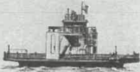
Sugar Islander II

Ferry leaves Sugar Island on the hour and half-hour.