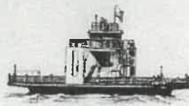
Sugar Islander II

Ferry leaves Sugar Island on the hour and half-hour.